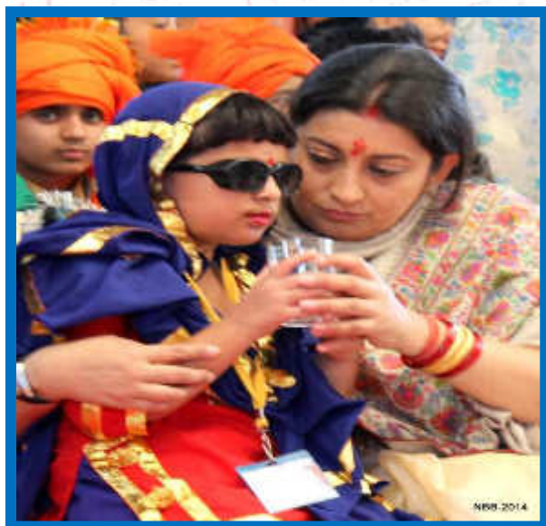
Hon'ble Minister HRD Smt. Smriti Zubin Irani sharing a moment with differently abled child from Jammu Bal Bhavan.

In Bal Sansad children held mock parliament in session and exchanged various questions based on education system etc. This was followed by entry of Hon'ble Minister into the Open Air Theatre amidst Mass singing by children. Welcome address was delivered by Smt. Shallu Jindal, Chairperson NBB. First of all Hon'ble Minister paid floral tributes to Pt. Jawahar Lal Nehru on his 125th birth anniversary along with children.