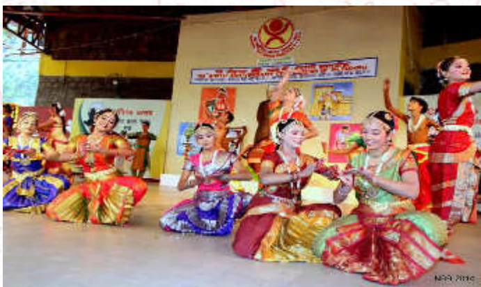
Member children of NBB giving message through various classical dance forms